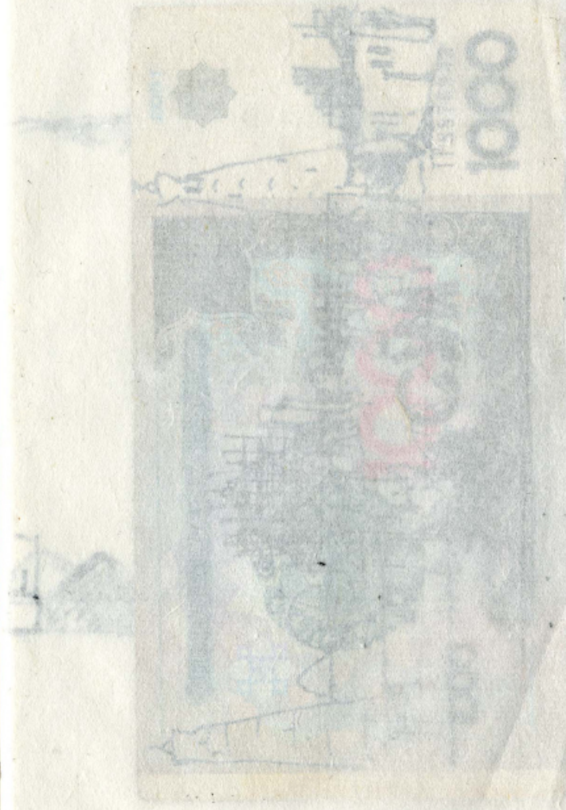
nomadic to nomadic drawing